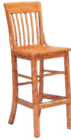
MODEL 308A (SHOWN)