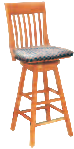
MODEL 319C (SHOWN)