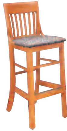
MODEL 307C (SHOWN)