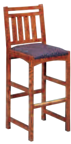
MODEL 338C (SHOWN)

WOOD SPECIES: OAK IN 14 FINISHES. SEE PAGE 221. UPHOLSTERED SEATS CONSTRUCTED WITH FLEX-WEB FOR ADDED COMFORT AND SUPPORT. OPTIONAL CASTERS AVAILABLE ON ALL LEGS. ADD $75 LIST FOR SET OF 4 CASTERS. NOT AVAILABLE ON BARSTOOLS. OPTIONAL GANGING BRACKET AVAILABLE FOR ARMLESS CHAIR ONLY. SPECIFY AS AN OPTION WHEN ORDERING. ADD $20 LIST PER GANGING DEVICE. OPTIONAL SINGLE TOP HORIZONTAL BACK SLAT AVAILABLE. SPECIFY AS AN OPTION WHEN ORDERING. NO UPCHARGE.