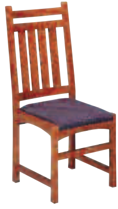
MODEL 333C (SHOWN)