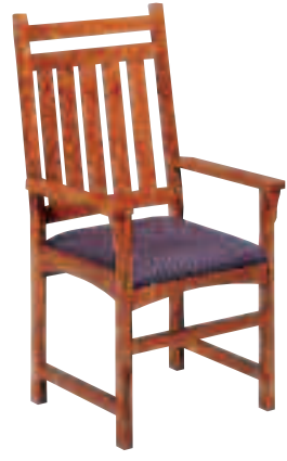
MODEL 331C (SHOWN)